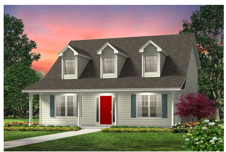
Cabin Cape Cod