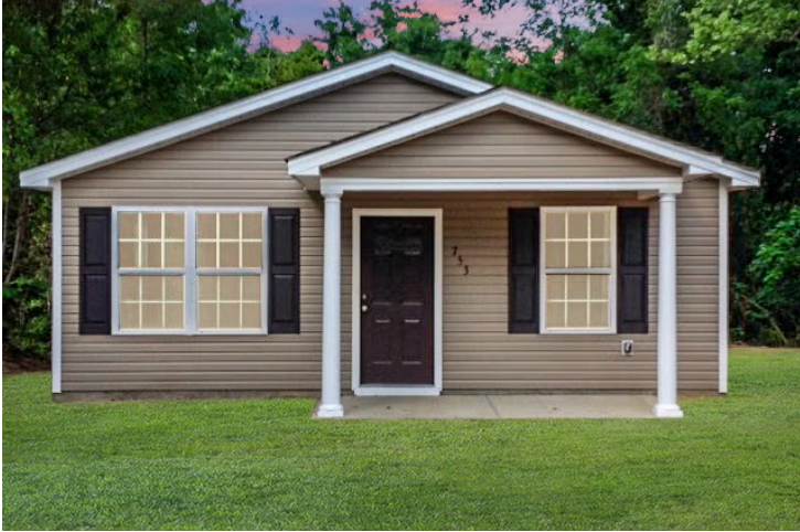
Classic with Full Front Porch