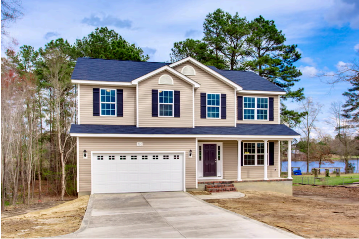
Classic with Full Front Porch