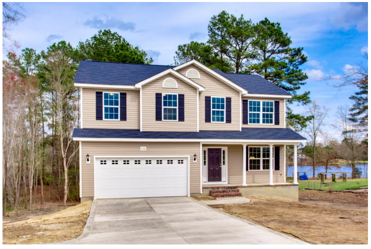
Classic with Full Front Porch