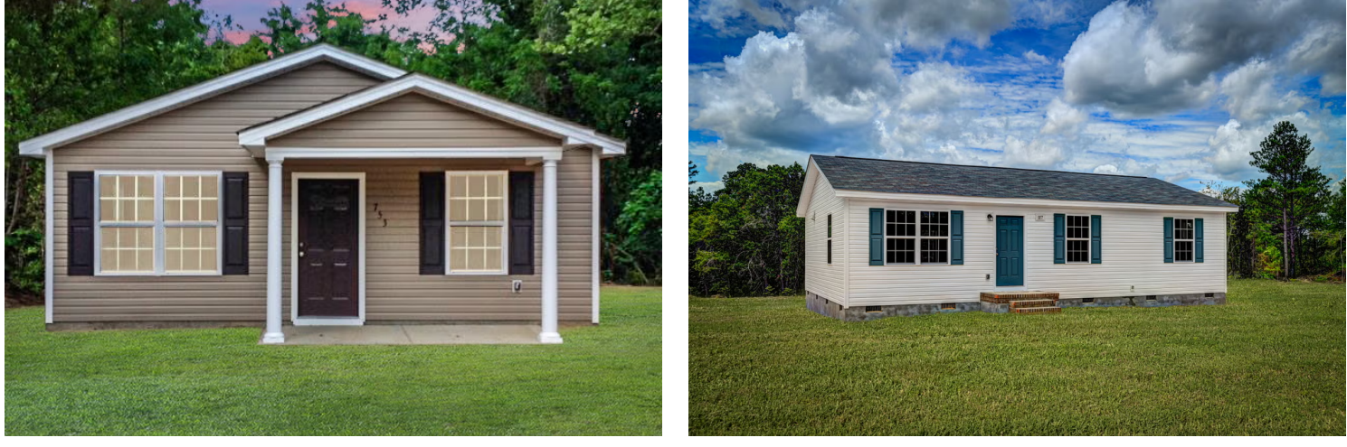
Classic with Full Front Porch