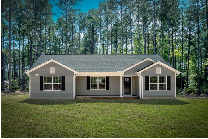
Classic with Full Front Porch