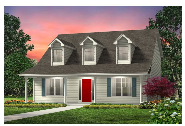
Cabin Cape Cod